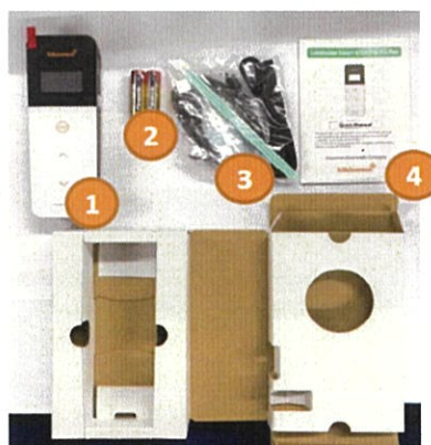
Contents of Product

1. Lumitester Smart, 2. Battery, 3. Other accessories, 4. Manual